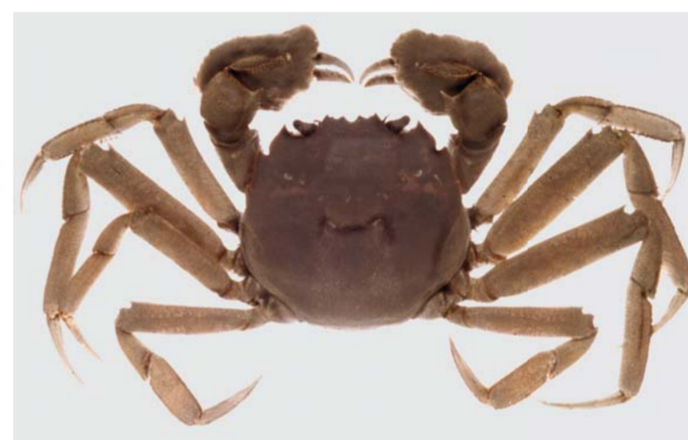
Eriocheir sinensis Chinese Mitten Crab Look out for: White tipped hairy front claws and a deep notch between the eyes.