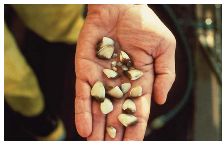
Potamocorbula amurensis Asian Clam Look out for: A dirty white, yellow or tan clam with very visible overbite (two shell halves different sizes), 2-3cms across.