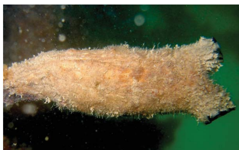
Styela clava Sea Squirt Look out for: A tubular club-shaped body tapering to a stalk. It has a tough, leathery skin and is brownish white, yellow-brown or reddish brown.