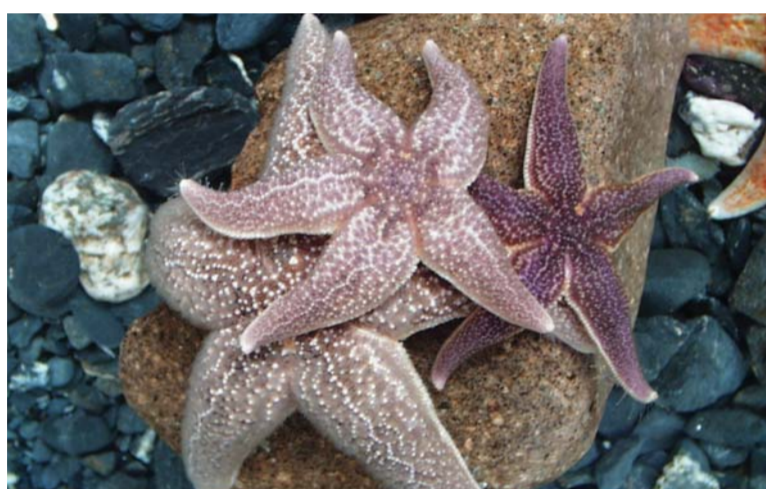
Asterias amurensis Northern Pacific Sea Star Look out for: Five rays or arms with upturned tips. Yellow, orange or red with purple markings on top.

These international pests could cause serious problems to our marine environment and economy. With your eyes to help us we can act quickly to stop them establishing here. Thanks for doing what you can to protect New Zealand waters.