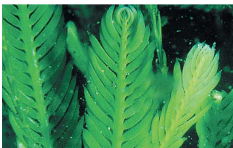
Caulerpa taxifolia a Marine Aquarium Weed Look out for: Bright green seaweed with horizontal runners up to 9m. Fronds are flattened with a smooth distinct midrib.