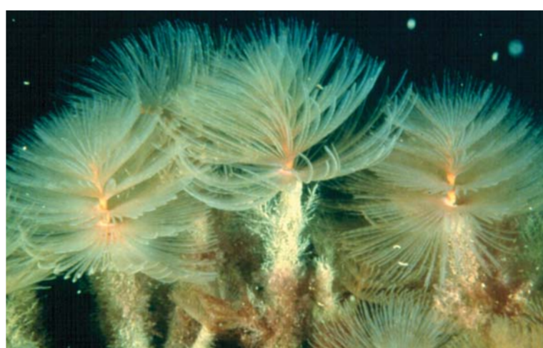
Sabella spallanzanii Mediterranean Fanworm Look out for: A single spiral fan that is white and banded with orange/brown up to 40cm tall.