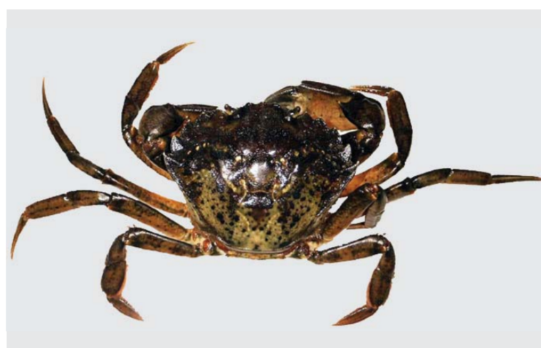
Carcinus maenas European Shore crab Look out for: Greenish (sometimes with reddish/orange tint) body shell about 8cm wide. Five sharp spines behind each eye on edge of body shell.