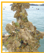
Styela clava sea squirt fouling mussel lines and making harvesting difficult on Waiheke Island