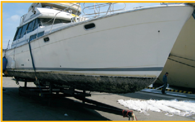
A FOULED HULL

Recent new introductions of two pest sea squirts ( Styela clava and Eudistoma elongatum ) and a pest fanworm are believed to have arrived on boat hulls. These will spread and impact on coastal resources without costly management measures.