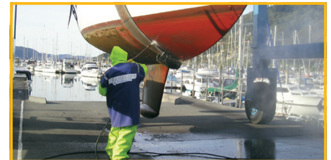
A HULL BEING CLEANED

You should not clean your hull by beaching or careening your boat. In water cleaning could be used for removing primary fouling - a light slime layer and is useful for ongoing maintenance of a clean hull. But once again, if you have fouling above this level you should only clean your vessel in facilities with waste containment.