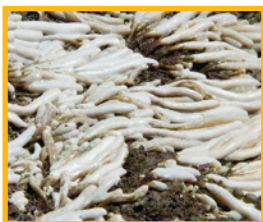
Eudistoma elongatum sea squirt on beach in Northland