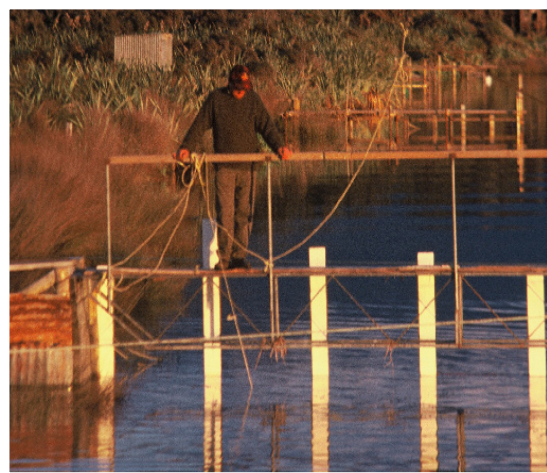
EARLY MORNING WHITEBAITER

Cleaning is only necessary when moving between waterways