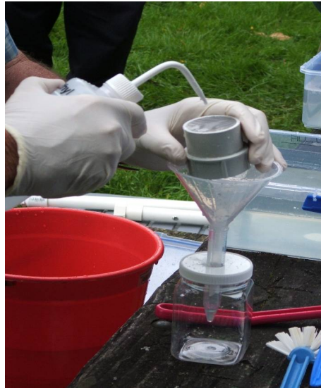
Figure 3. Wash the material from the cod end into the Falcon tube with 70% ethanol.