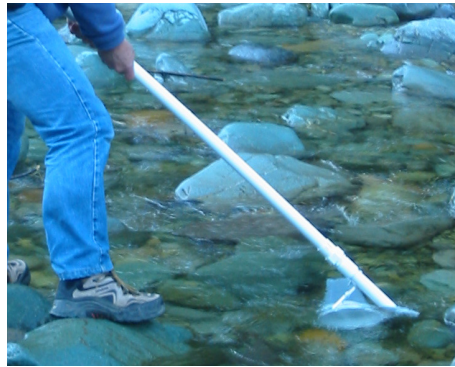
Figure 2. Deployment of the Hicks handle net for sampling algal drift.