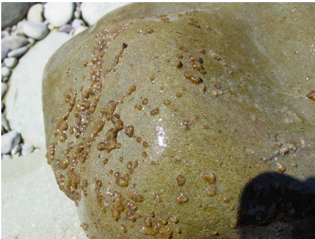
Figure A2: Colonies of a red alga that look a bit like D. geminata .