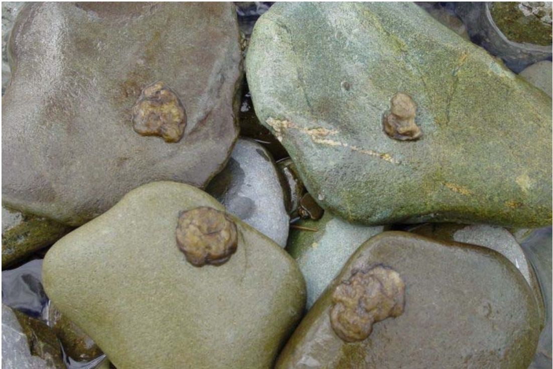
Figure A3: A later stage of the growth of D. geminata .