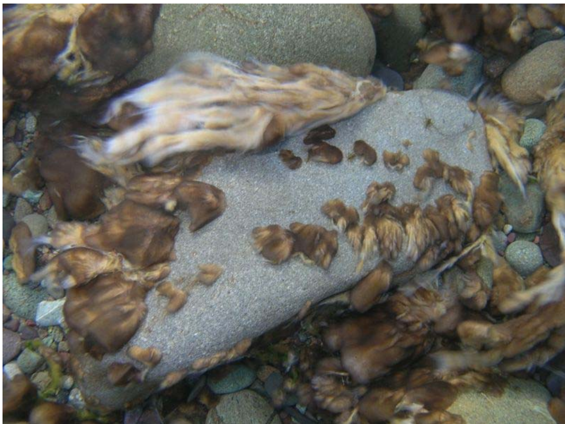
Figure A4: A more advanced stage of the growth of D. geminata .