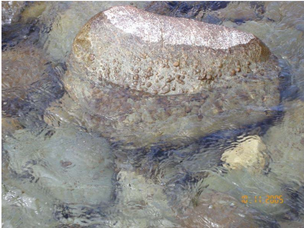
Figure A1: Small D. geminata (didymo) colonies