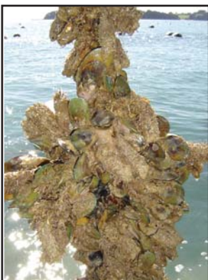
Styela clava sea squirt on mussel line at Waiheke Island