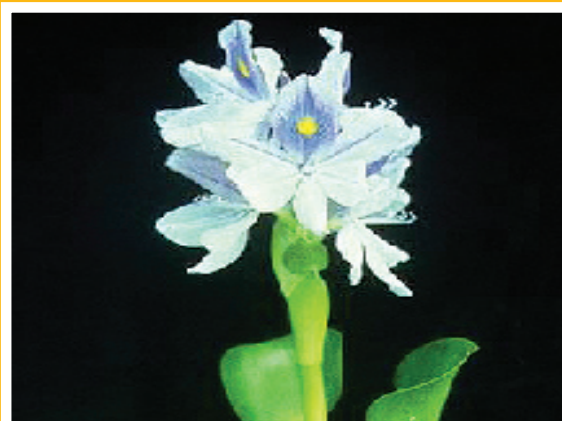
WATER HYACINTH PLANT

You can help us to get rid of water hyacinth. If you have seen it or suspect you have seen it, please contact MAF Biosecurity New Zealand on freephone 0800 80 99 66 .