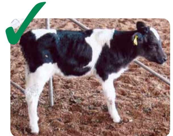
Fit for transport