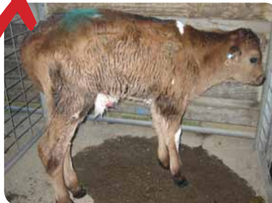
Not fit for transport