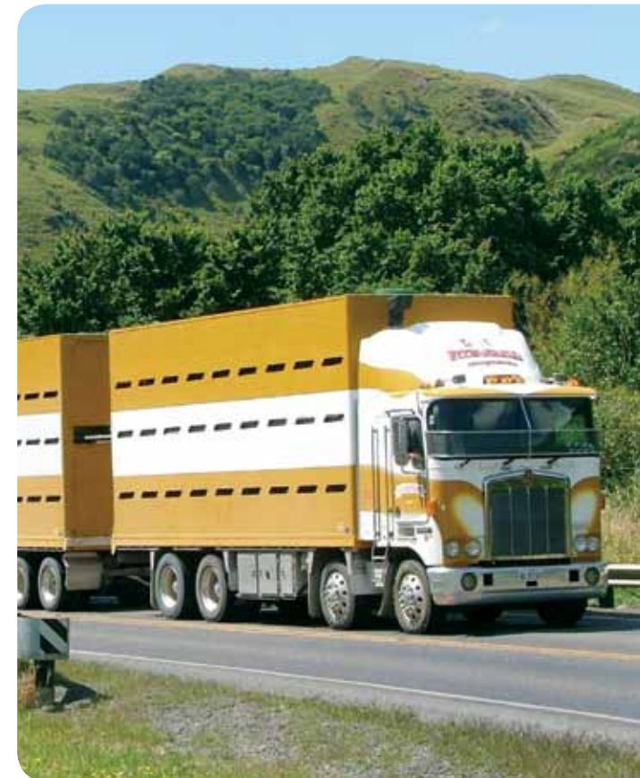
Transporting calves