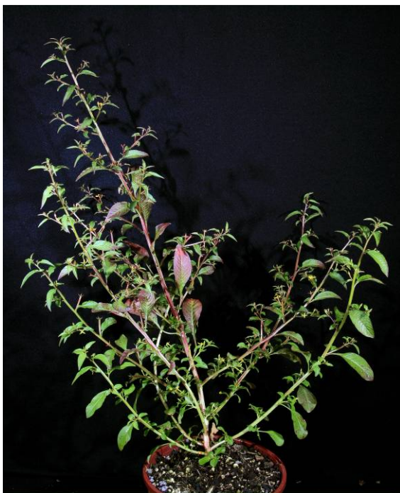
General plant form