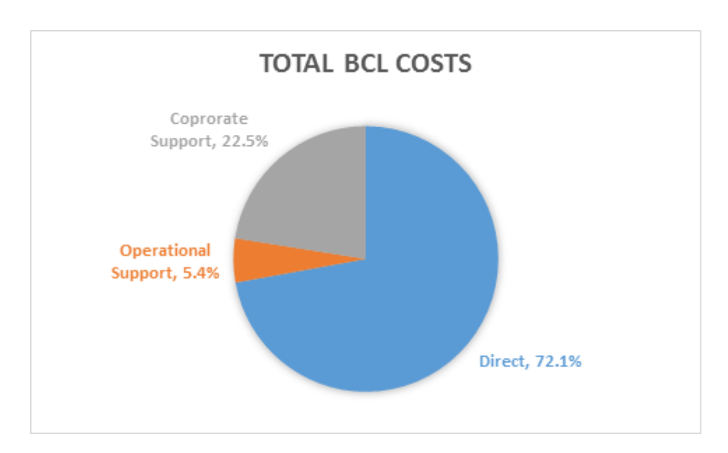
Figure 1. Total BCL costs by category