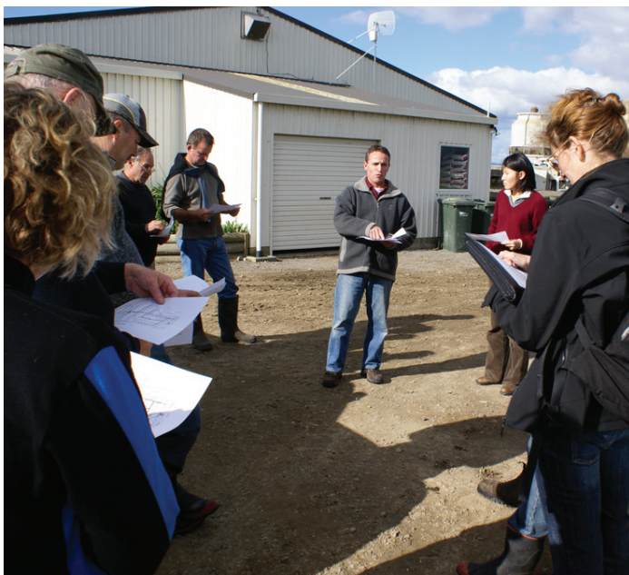
How farmers respond to climate change was the focus of a recent SFF project in the Bay of Plenty.