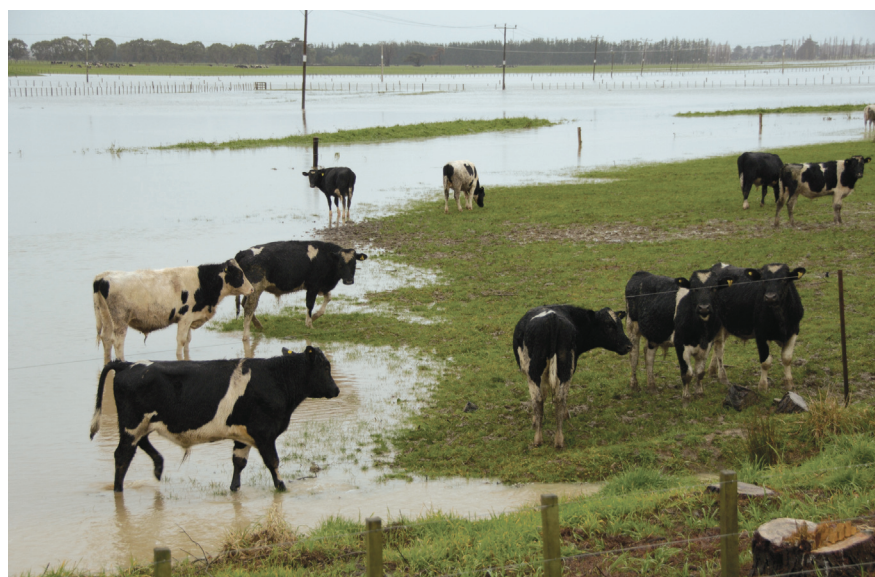
Cattle moving to high ground during the 2006 Wairarapa floods.

However, there is uncertainty around scenarios of rainfall change and even more so with scenarios of wind change. The level of uncertainty is indicated by the ranges provided in both the results of modelling and the climate change guidance produced by the government. Uncertainty is discussed in Fact Sheet 3, Models, scenarios and uncertainties . Variability in New Zealand's climate is detailed in Fact Sheet 2, New Zealand's variable climate . These caveats need to be kept in mind with the following summary information.