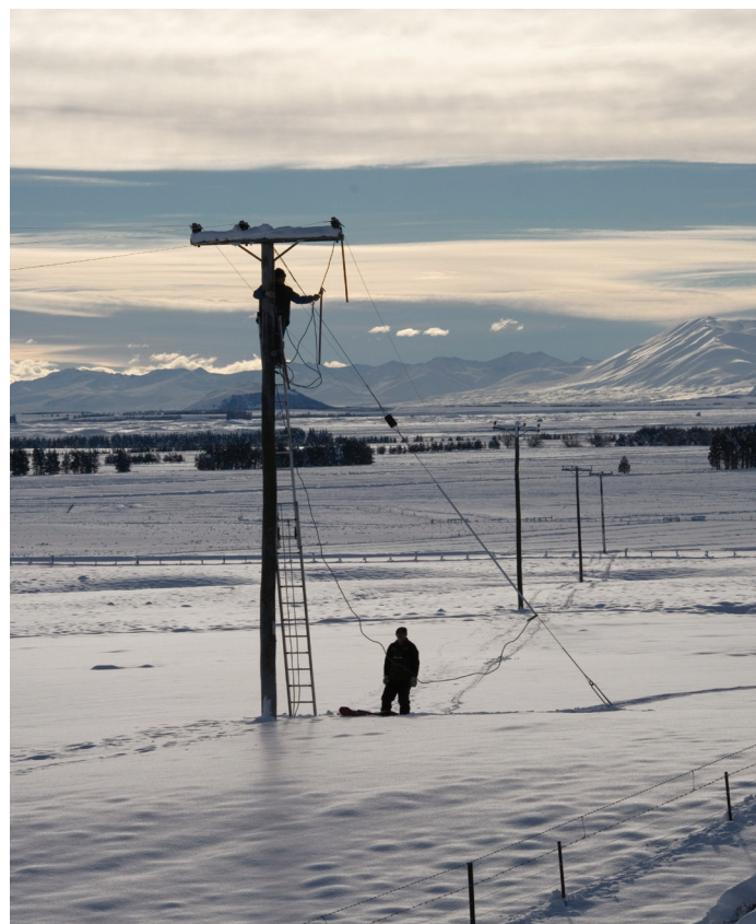
Canterbury snowstorm, July 2006.

While every effort has been made to ensure the information in this publication is accurate, the Ministry of Agriculture and Forestry does not accept any responsibility or liability for any error of fact, interpretation or omission.