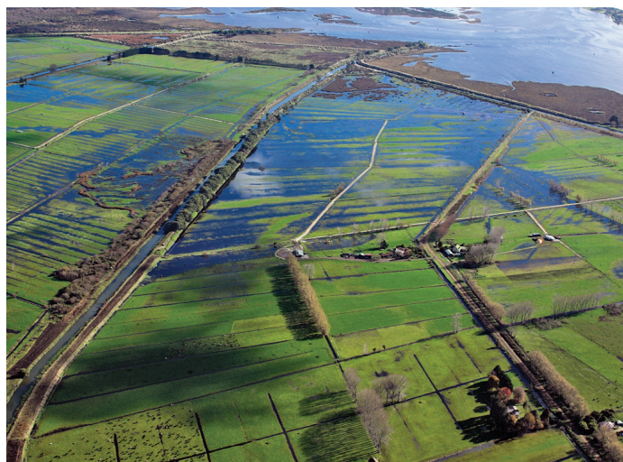
Waterlogged paddocks north of Matata, Bay of Plenty.

Heavy rainfall events are likely to occur more frequently in New Zealand over the coming century, particularly where average annual rainfall is projected to increase. What is considered an extreme rainfall in the current climate might occur about twice as often by the end of the 21st century. A warming atmosphere will be able to hold more moisture, increasing the potential for heavier rainfall and consequently increasing the risk of floods.