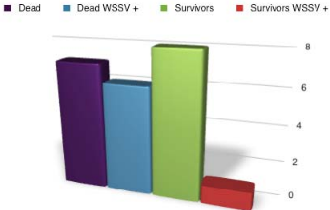
Lysmata wurdemanni experiment TWO. N = 10 (Laramore, 2007)

All L. wurdemanni challenged in experiment one were adults which were fed WSSV infected flesh. Out of fifteen individuals, only seven, or 46.67% actually proved to be infected with WSSV. Six out of the seven dead adults tested positive for WSSV. The other however, is suspected to have perished through environmental stress. Out of the eight surviving adults, only one tested positive for WSSV. This shows us that Lysmata sp. do seem somewhat resistant to WSSV. This raises the point that nearly all infected individuals would perish before making arriving at our borders. Additional quarantine using suggested measures below should suffice is identifying any others which arrive.