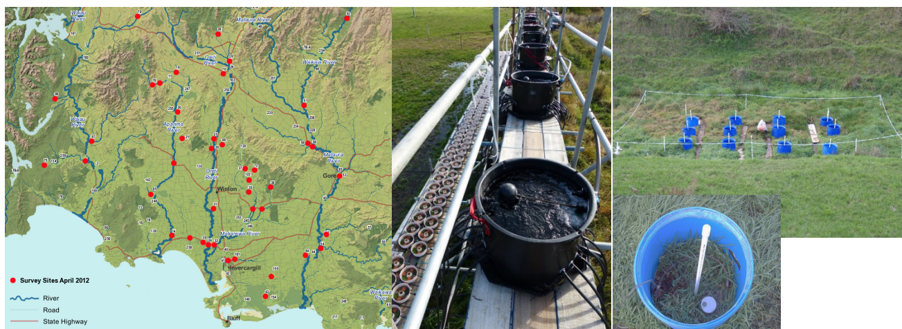
Figure 1. The Southland stream and river sites (indicated by red dots; stream orders mainly 4-6, stream widths about 3-50 m) sampled during the survey (left), the setup with 128 circular stream channels in North Otago used for the three stream channel experiments (middle), and the mesocosm experiment in a headwater seepage wetland on a Waikato dairy farm (right).

Scientists at Otago University and NIWA examined the effects of DCD in combination with other agricultural stressors using a survey of 43 Southland streams and rivers, three manipulative experiments in 128 small circular stream channels on the banks of a North Otago river, and one experiment in mesocosms installed in a headwater seepage wetland on a Waikato dairy farm. The biological responses studied included both structural indicators (stream algae, bacteria, invertebrates and fish) and ecosystem processes (e.g. algal biomass accrual and organic matter decomposition), to provide a comprehensive assessment of the potential impacts of DCD.