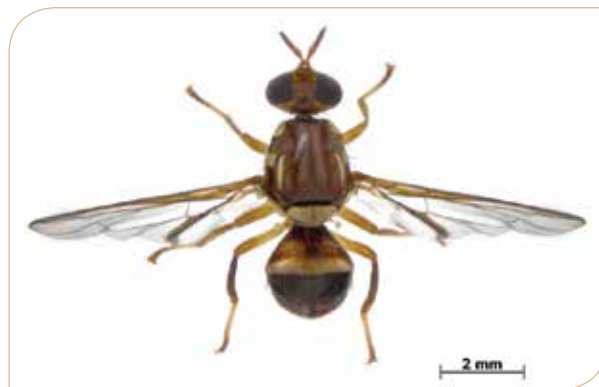
Enlarged picture of a fruit fly seen from above.