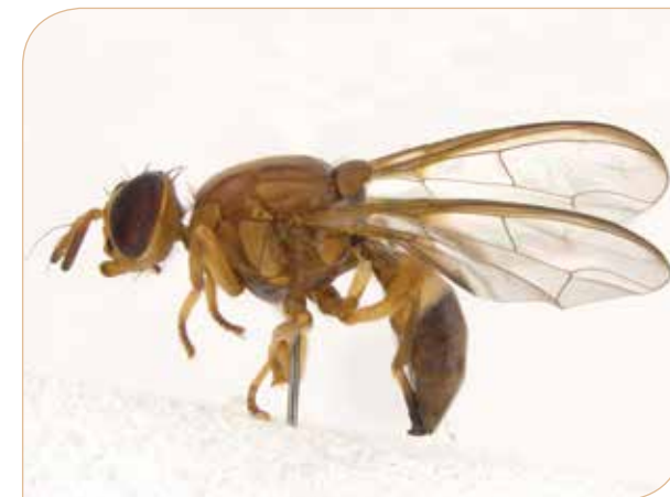
Enlarged picture of a fruit fly seen from the side.

If you find maggots in ripening or ripe fruit put the fruit into a plastic container with several scrunpled pieces of tissue paper, put the lid on, place it in the fridge and phone MPI on Freephone 0800 80 99 66 .