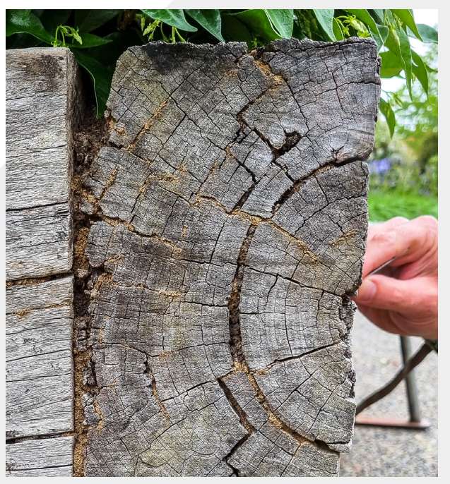
Subterranean termite 'mudding' – termites pack mud into gaps in the timber.

You are likely to notice signs of termite activity before you see termites themselves. You may see evidence of subterranean termite "mudding" – which is where termites pack mud into gaps in timber. Or you may see mud tunnels up walls or across open ground.