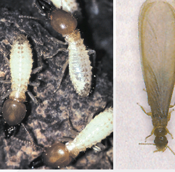
Soldiers are 5–7mm long with brown heads and long jaws.

Soldiers are 5–7mm long with brown heads and long jaws. Workers are all white. Alates are brown with two sets of light brown wings and are about 12mm long at rest with wings laid flat.