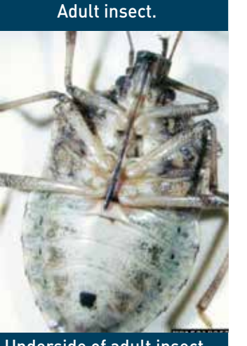
Underside of adult insect.