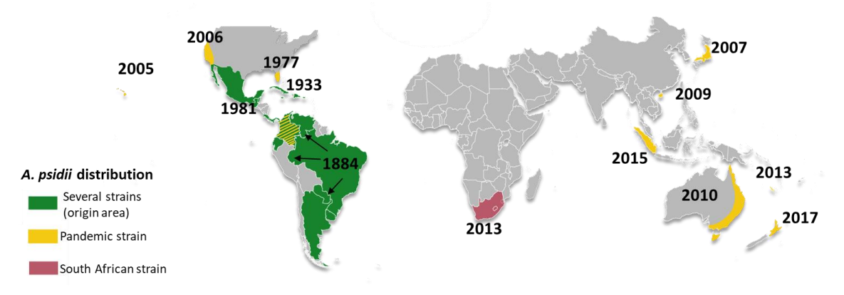
Figure 1.3.1. Global distribution of Austropuccinia psidii and the year the pathogen was first recorded in different countries or regions.

Given the rapid global dispersion of the pandemic biotype, an understanding of the level of susceptibility of Myrtaceae species in New Zealand to other strains of A. psidii is essential to future-proof against any further introduction. The objective of this study was to screen seed collected from natives species of New Zealand Myrtaceae against overseas strains of A. psidii that are not currently present in New Zealand.