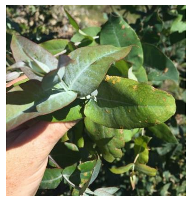
Photo 1. Eucalypt leaves infected with Austropuccinia psidii in Uruguay.

Seed from the same seed lots that were sent to South Africa were sent to Uruguay for testing against the strain of A. psidii that has caused problems in Eucaplytus spp. in South America (Photo 1). Seed will be germinated, inoculated and screened once border inspections have been completed. This strain has caused problems in eucaplyts in South America and is different from the strains present in New Zealand and South Africa.