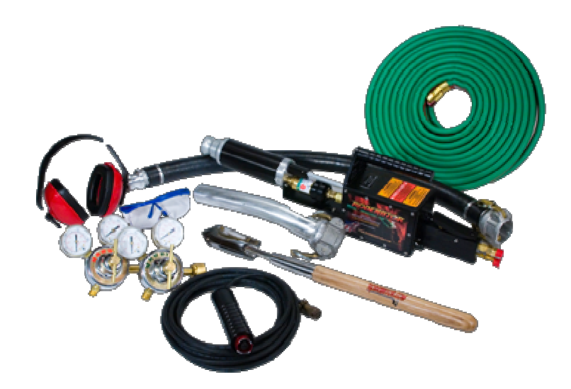
Figure 2.1 Components of the 'Rodenator R3' (Rodenator 2010).

The Rodenator (Fig. 2.1) is a mechanical device for in-burrow rabbit control. The device is used to inject a calibrated mixture of liquefied propane gas (LPG) and compressed oxygen (O2) into burrows. The proportion of gases is approximately 2 percent LPG and 98 percent compressed O2, with injection of the gases being monitored over time to ensure the amount is within a specified protocol (Anon. 2009). Injection times can range from 2 s to 3 min depending on the type and size of the burrow.