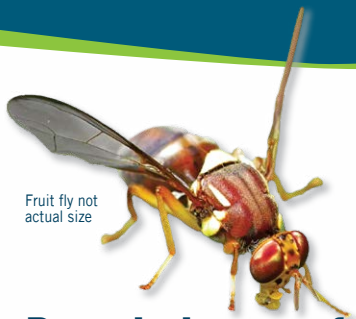
Fruit fly not actual size