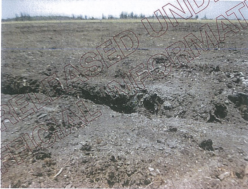
Ready for cultivation