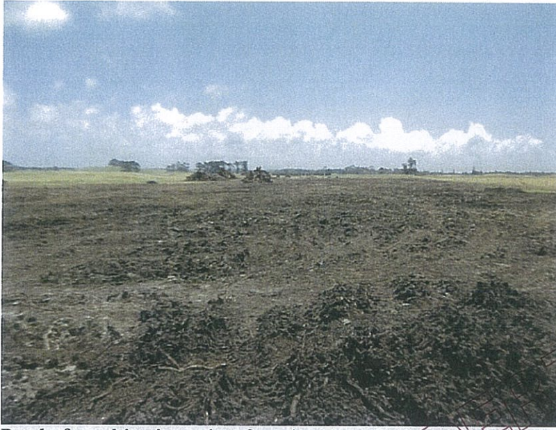
Ready for cultivation, taken from location of original site visit