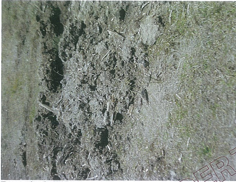
Excavation in pasture

RELEASED UNDER THE OFFICIAL INFORMATION ACT