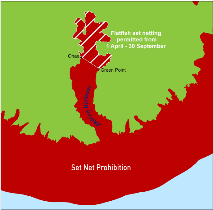
Map 3: Flatfish set netting area within the Akaroa Taiāpure.

Recreational fishers may use flatfish set nets between 1 April and 30 September (both days inclusive) inside a line Green Point to Ohae Point (see map 3).