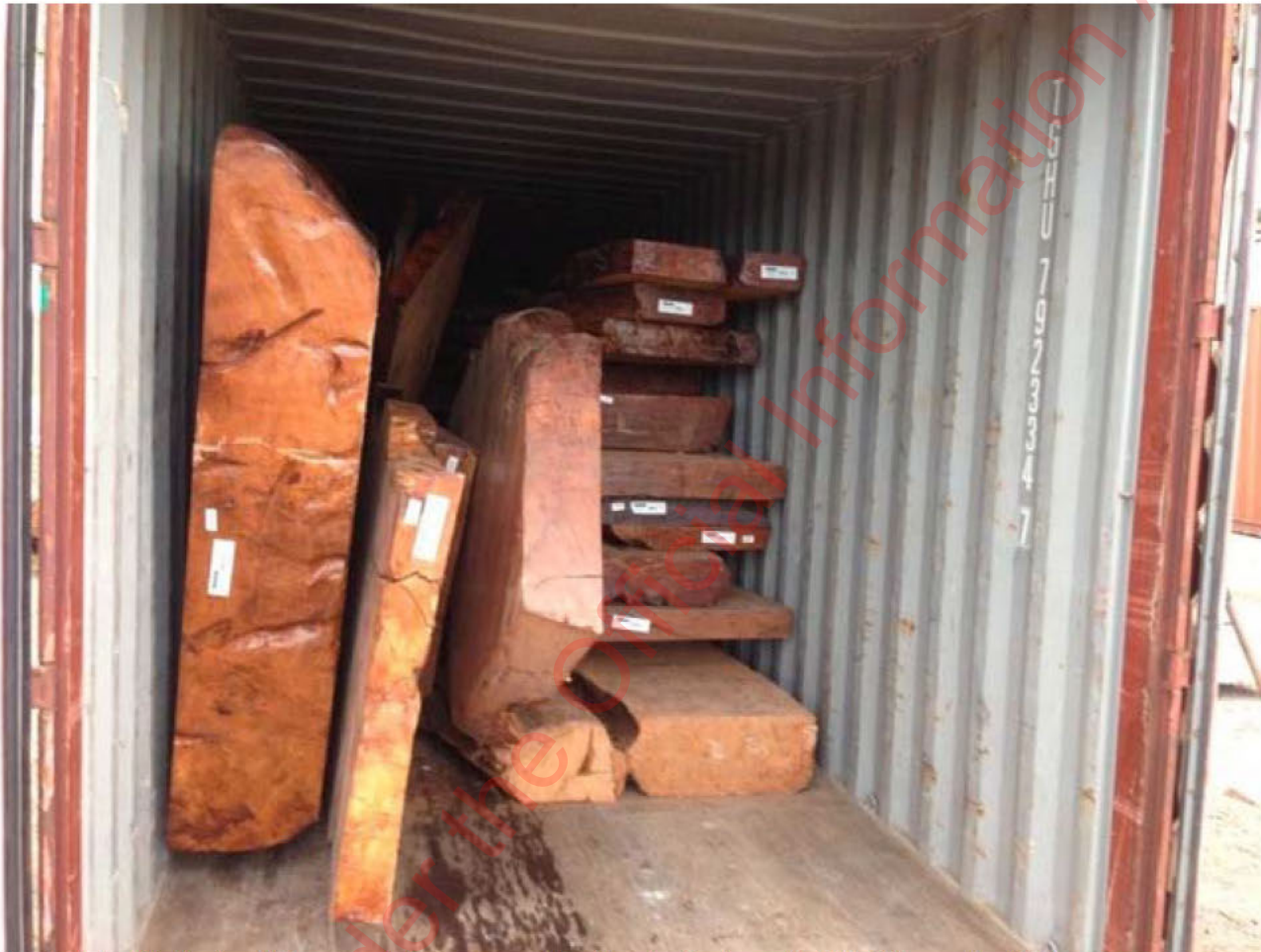
Kauri slabs ("table tops") in a container, as received by Ancientwood Ltd in Wisconsin, USA. None is remotely in finished form as required by the Forestry Act for export.