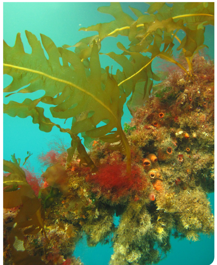
Undaria on mooring rope in Sunday Cove

Your help is needed to ensure Undaria and other pest species don't make it to Fiordland again. Pests like Undaria and other fouling species can hitchhike to new locations on dirty boat bottoms and marine equipment.